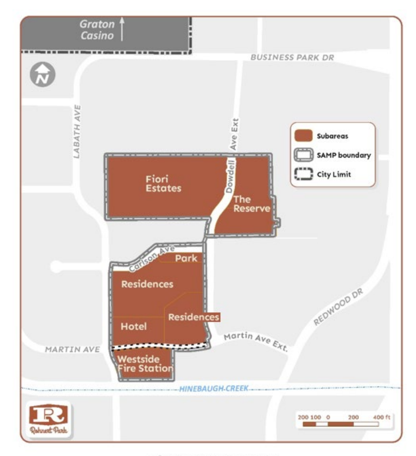
Figure 3 – SAMP Subareas